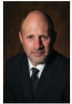
HE de la Rey