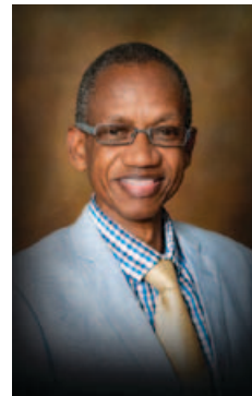
BS Mene SC